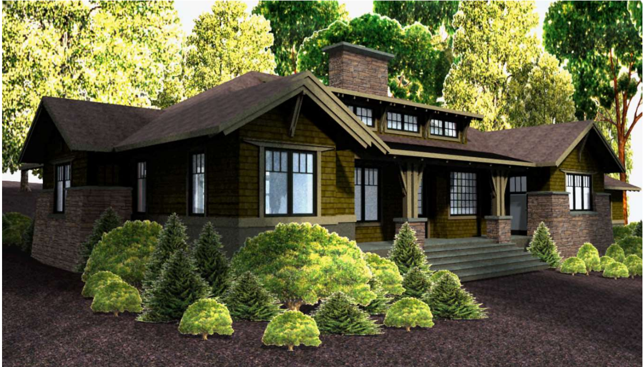
Cottage Entry View

The Cherry Blossom Cottage is infused with Japanese architectural elements, giving it a lovely appearance and tranquil cottage feel from the entrance to the flow of the interior layout.